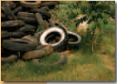
Tires provide breeding sites for mosquitoes.