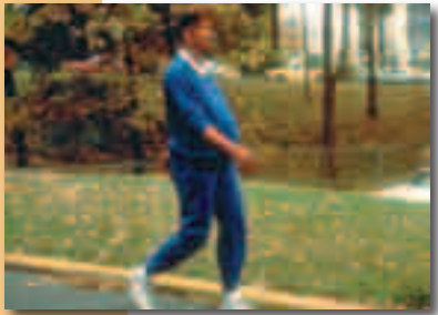
When pregnant workers are outside, they should avoid mosquitoes, wear protective clothing, and use an effective repellent.

When pregnant workers are outside, they should follow the recommendations at the end of this brochure