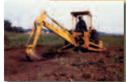
Outdoor workers should be trained about the risks of WNV exposure and infection.

Outdoor workers are at risk of WNV exposure any time infected mosquitoes are biting. Most WNV infections occur from July through September. Many mosquitoes are most active from dusk to dawn. However, some are active during the day. If possible, avoid working outdoors during peak activity times for mosquitoes. When you must work at such times, pay special attention to the use of personal protection such as protective clothing and insect repellent to reduce the potential for exposure.