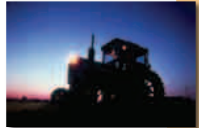
Many mosquitoes are most active from dusk to dawn.