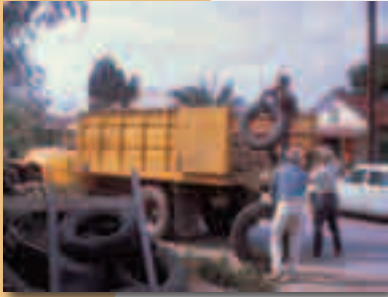
Removing tires from worksites helps to reduce mosquito populations.

Employers should protect their workers from WNV exposure by taking the following steps: