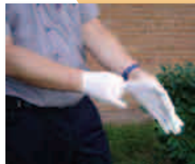
Wear gloves if you must handle dead animals.

Testing for WNV infection is available. No vaccine is currently available to prevent WNV infection in humans.