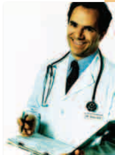
Visit your health care provider if you develop WNV symptoms.