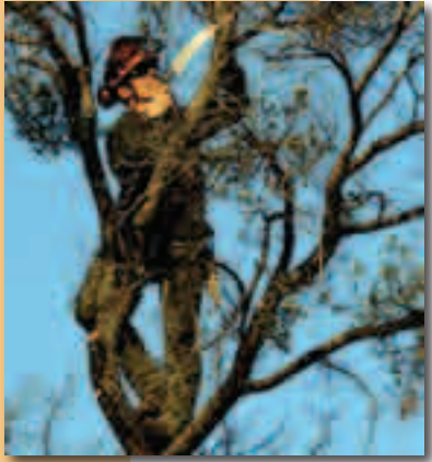
Outdoor workers are at risk of WNV infection.