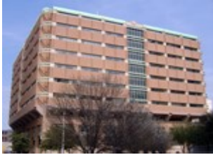
Tim Curry Criminal Justice Center

401 W Belknap Street Fort Worth, TX 76196