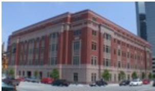
Family Law Center

401 W Belknap Street Fort Worth, TX 76196