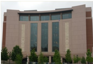
Tom Vandergriff Civil Courts Building

200 E Weatherford Street Fort Worth, TX 76196