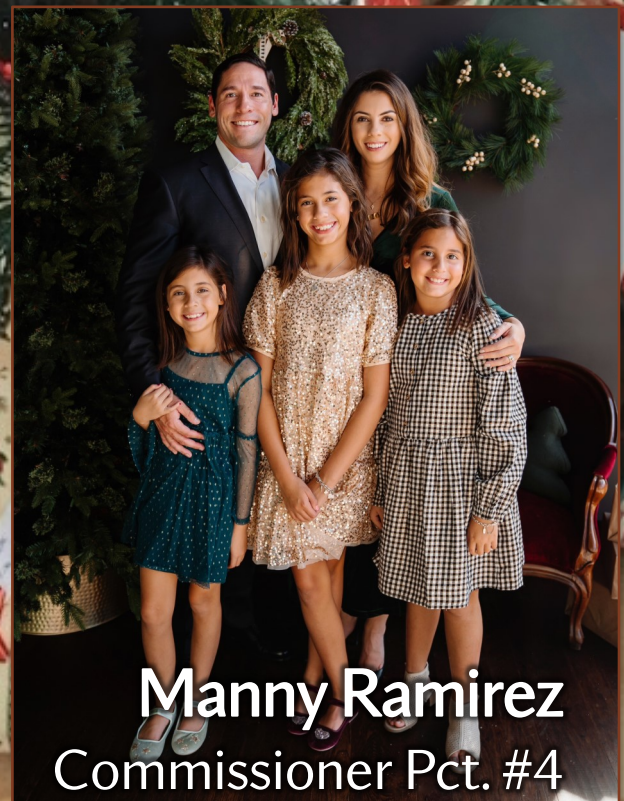
Manny Ramirez Commissioner Pct. #4