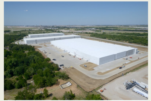
DFW International Logistics Center Bldgs. A,B,C. A.S. 20th Ave Improvements Photo #18062718 Date: 09/27/18 Lat/Lon: 32.841919 -97.053333 Order No. 84146 681-988-8888