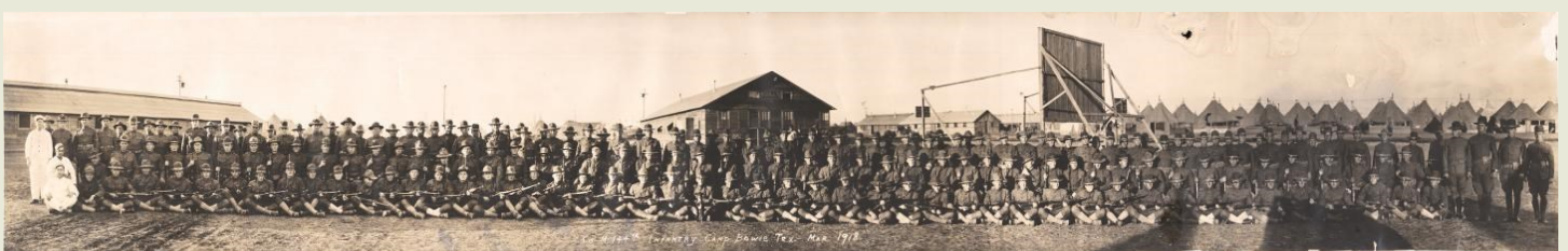
[Photograph of Company M, 144th Infantry at Camp Bowie, Texas], photograph, March 1918

victory to the Allies; a pivotal victory towards bringing Armistice on November 11, 1918. The 36th, also known as the Panther Division due to Fort Worth being the Panther City, stayed to help stabilize the region and did not have all its men on U.S. soil again until June 11, 1919. After demobilization, Camp Bowie reverted to civilian use. When the Texas National Guard entered World War II, its new camp at Brownwood was also named Bowie. To give an idea of the size of the camp, it extended from White Settlement Road in the north to Granbury Road in the south; from University Drive on the east to Lake Como on the west.