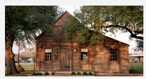
A replica of the 1836 capital in West Columbia.

In October 1836, Columbia (today's West Columbia) became the first capital of an elected government of the Republic of Texas. President Houston, on Dec. 15,