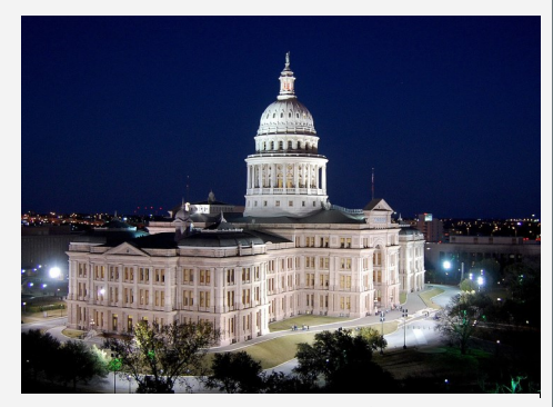
Texas State Capital

threatened San Antonio in March 1842, President Sam Houston ordered the government moved to Houston. Officials moved to Washington-on-the-Brazos in September and Houston sent men to Austin to fetch the archives. Austin citizens feared that if the papers were moved, Austin would lose its status as capital permanently. In an action known as the Archive War, the citizens stopped Houston's men and returned the archives to Austin. Austin became the capital again in 1844.