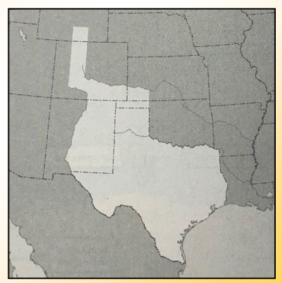
Answer: 6 states -Texas New Mexico Oklahoma Kansas Colorado Wyoming

Question: The boundary of the Republic of Texas in 1836 includeds parts of how many current states, including Texas?