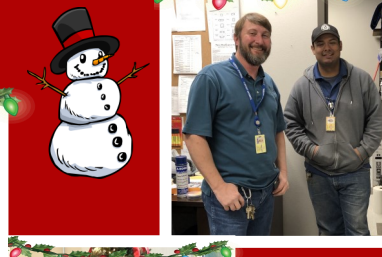
Tarrant County & Credit Union Employees