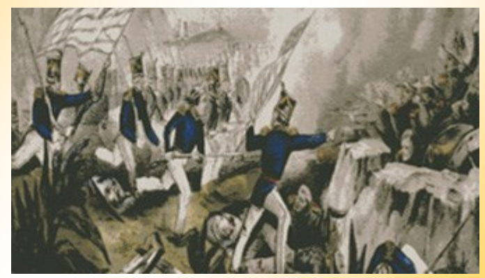
Mexican-American War battle scene

Answer: It was not resolved until the Treaty of Guadalupe Hidalgo was signed after the Mexican-American War in 1848.