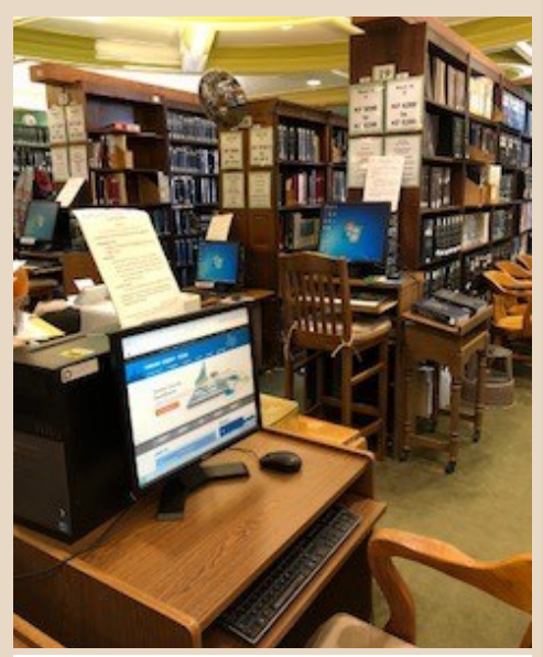
judges. The Law Library is open Monday through Friday from 8 am to 5 pm, and staff can also answer simple questions over the phone.

Dell Dehay Law Library 100 W. Weatherford, Room 420 Fort Worth, Texas 76196