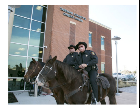
Tarrant County Mounted Patrol