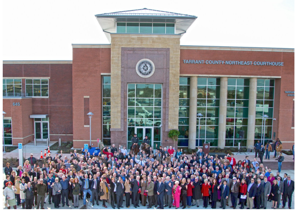
Grand Opening & Ribbon Cutting - Jan. 23, 2015

Over 400 citizens, business and community leaders, elected officials, and seven chambers of commerce attended the grand opening and ribbon cutting for the new TCNEC at 645 Grapevine Highway in Hurst on Friday, January 23 at 11:00 am.