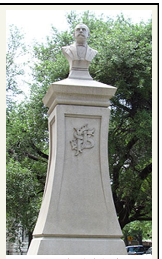
Monument located at 1206 Throckmorton Street, Fort Worth, TX 76102 View on Google Maps

Reference: http://fortworthtexas.gov/ flashback/2012/05/fort-worth-flashback-john-petersmith-was-early-fort-worth-promoter/