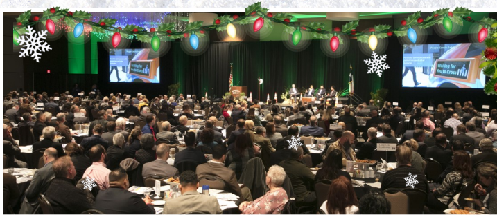
Northeast Tarrant Transportation Summit

We are grateful for our many blessings this year. Wishing you the Happiest of Holidays and all the Best in the New Year!