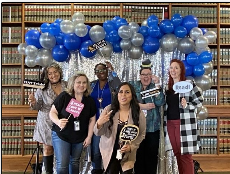
Dell DeHay Law Library Staff celebrating National Library Week in April.

100 W. Weatherford, Room 420 Fort Worth, TX 76196