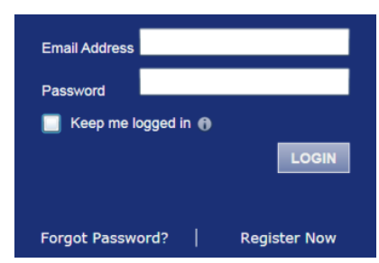
Figure 2.5 – eFileTexas.gov Login Area