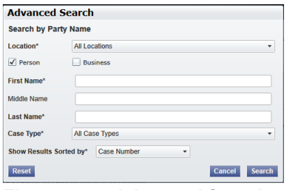
Figure 3.7 – Advanced Search Dialog Box