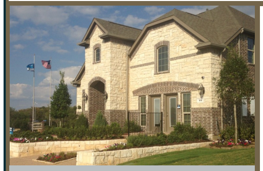
Lennar Home being built in the Dominion at Bear Creek Subdivision

What an awesome time to be in Euless, Tarrant County. There are currently twelve active subdivisions totaling 570 platted lots. Nine of these are new neighborhoods. 64 permits have been issued in 2014, with an average value of $270,000. Lennar is developing a variety of single family homes at the northwest corner of S.H. 360, north of SH 183 in the RiverWalk mixed use development. Bloomfield Homes is building homes in 6 different areas around town.