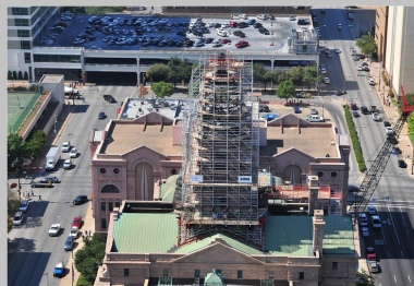
1895 Courthouse Clocktower Renovation