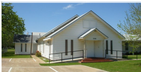
Lonesome Dove Baptist Church

Lonesome Dove, Texas, or the Missouri Colony, was a real community here in Northeast Tarrant County. Located in the area that is now northern Southlake and Grapevine, Lonesome Dove had a blacksmith shop, school, church, and restaurant with a Woodmen of the World hall upstairs. The community existed on the edge of the Cross Timbers. Many descendants of the original families still live in the area today.