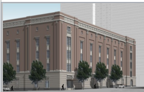
New Maximum Security County Jail