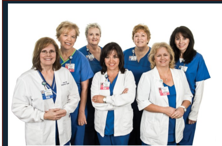
Texas Health HEB had 7 Great 100 Nurses honored in 2011 by the Texas Nurses Association.

providing trauma care close to home. Local ambulances will be able to respond to emergency calls more quickly, a life-saving benefit to those who are seriously injured.