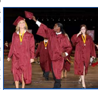
Each of our Keller ISD graduating 36 schools is students

g r a d u a t e s were offered $37 million in scholarships, a figure up more than $20 million in the last five years. Each of our 36 schools is committed to