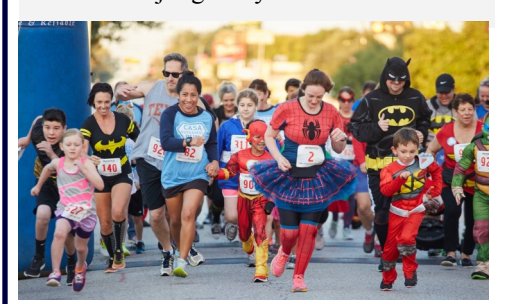
CASA Superhero Run

CASA of Tarrant County serves children removed from their homes by Child Protective Services, are in temporary custody of the state and have been placed with relatives or in foster care. CASA receives court appointments from judges to provide advocacy services to abused and neglected children from Tarrant County. Highly-trained CASA volunteers serve as the judges' eyes and ears in