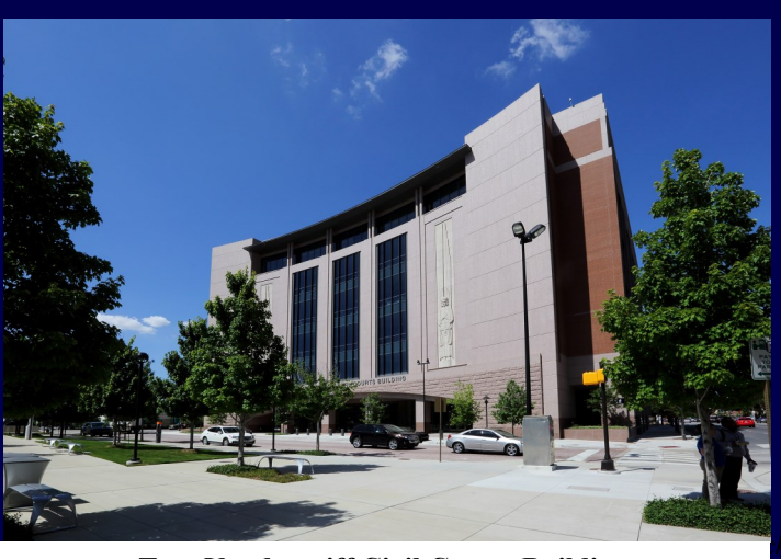
Tom Vandergriff Civil Courts Building