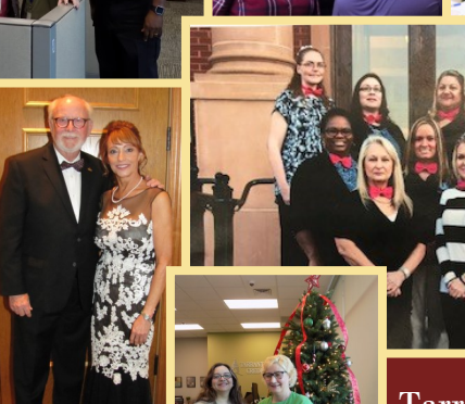
Tarrant County & Credit Union Employees