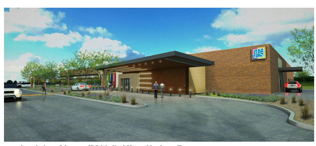
Layout and rendering of the new JPS Medical Home Northeast Tarrant