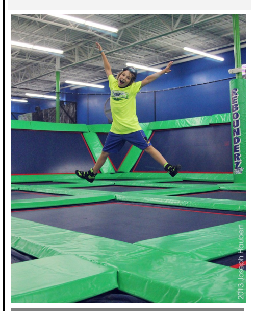
Rebounderz Trampoline Arena Hurst Outstanding New Business Award Winner

We are very thankful for the many businesses that have chosen Hurst and the HEB area to operate their business in. There are over 1300 businesses in Hurst and they were recently recognized at the Hurst Business Appreciation Dinner. Outstanding achievement was celebrated