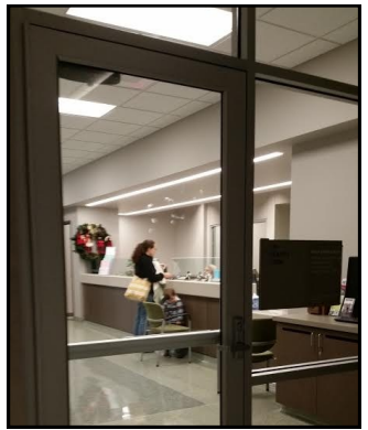
Northeast Courthouse 645 Grapevine Hwy., Hurst, Texas 76054