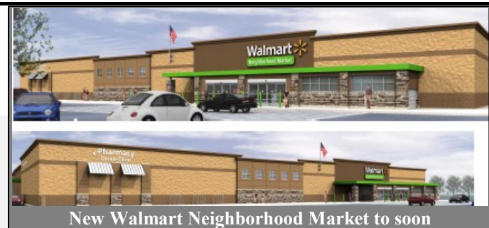
w Walmart Neighborhood Market to soon start construction in south Hurst

Brisk retail real estate activity continued through the 3rd quarter as 33 new businesses occupying 120,000 sq. ft. opened in the quarter. 107 new businesses have opened year-to-date. The new openings were highlighted by the introduction of the new Sprouts grocery store on Hwy 26 and Freedom Sports who opened their new motorcycle, four wheeler and waverunner 30,000 sq. ft. showroom. You won't go hungry in Hurst as nine new restaurants have opened this year including Las Daisy's Mexican Restaurant and Quick Thai Bistro this quarter.