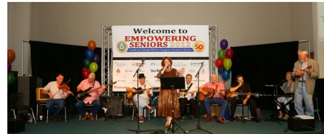
Young at Heart Band