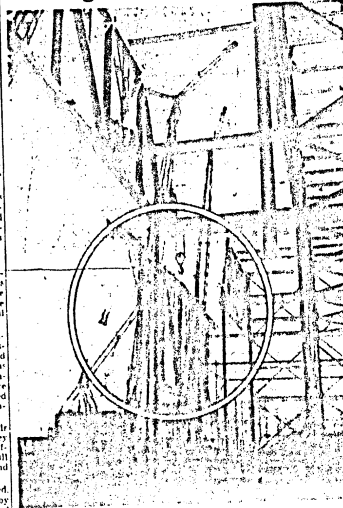
The last truss in the 270-foot line of the assembly building moved into place Tuesday at the Lake Worth bomber plant, marking the end of a long steel stretching 400 feet. The truss is being put at the north end of the project's main structure.