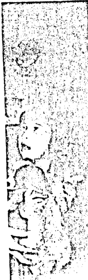
SKIPPY TO ITS OWN- ergency squad chopped a to face the punny in New